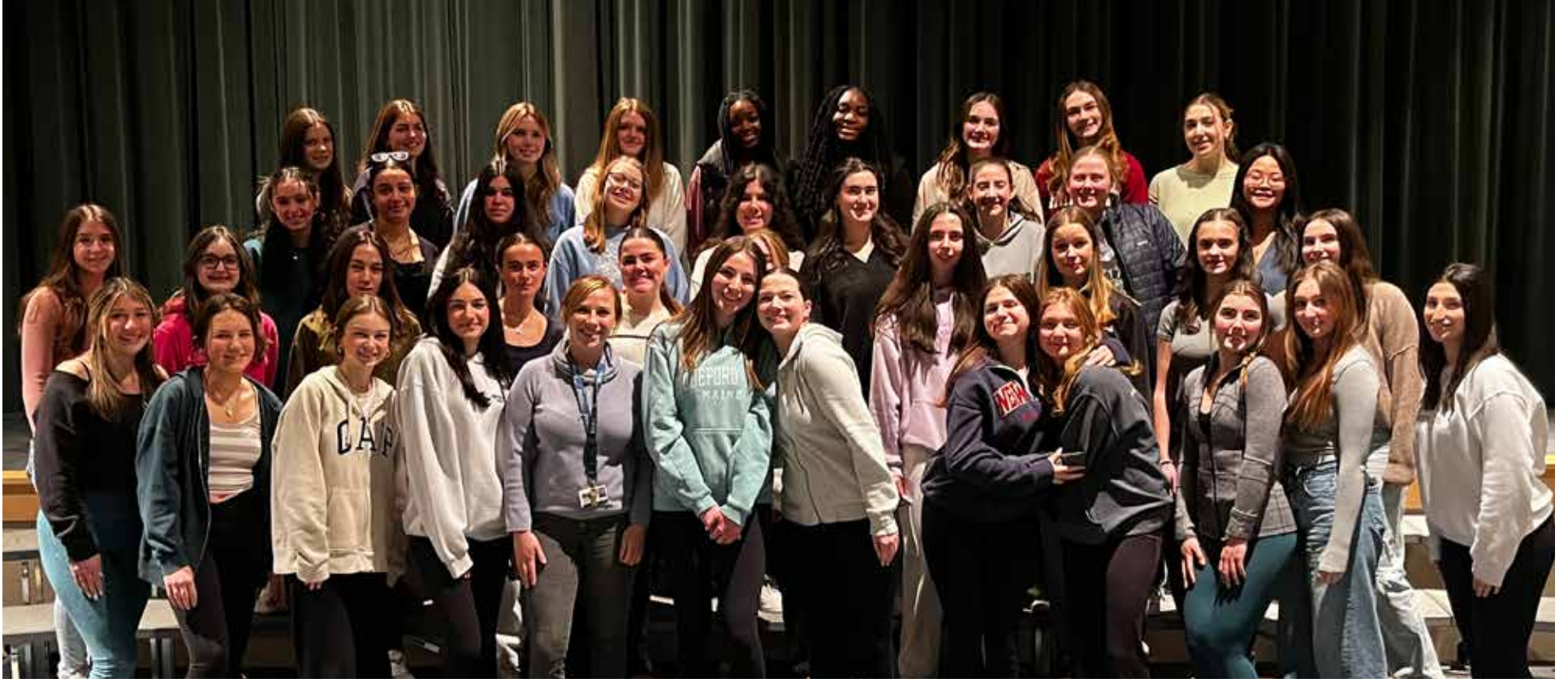
Wachusett Supporting Sisters 2024.